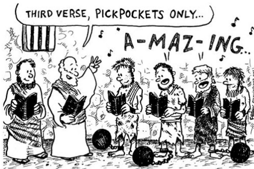
PAUL AND SILAS LEADING HYMNS WHILE IN PRISON.

If you would like to join a Growth Group, please contact the office